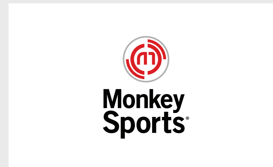
Do not change the layout or