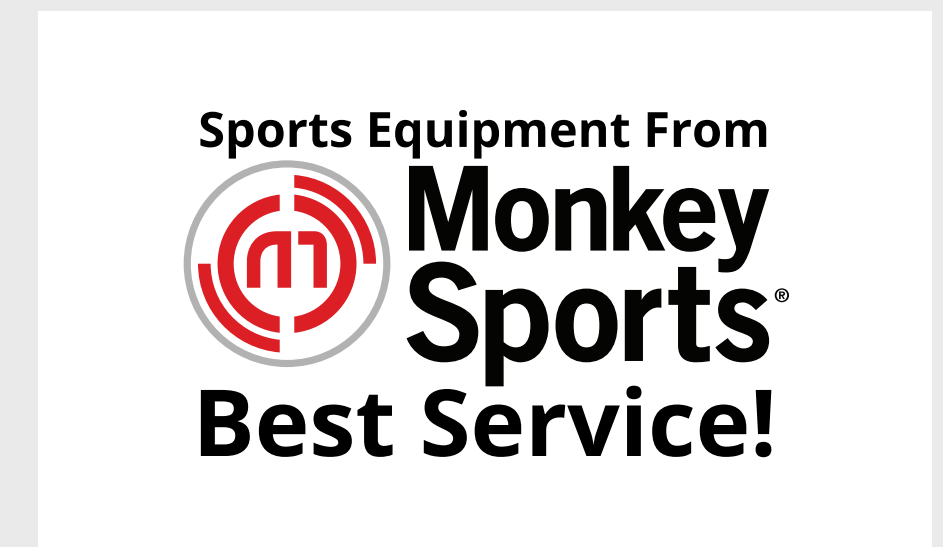
Do not encroach on the required clear

Note: This is not a comprehensive list of errors. These are simply the most common or egregious errors.