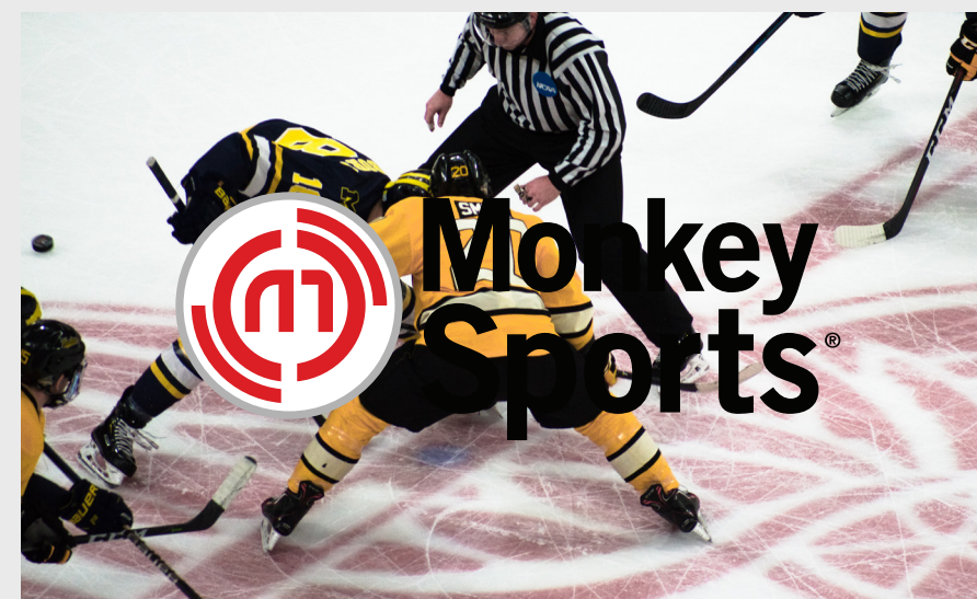
Do not place the logo on a high-